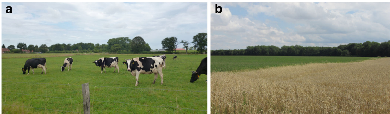
Fig. 1 View of fields included in the study on long-term organic farming systems in Trenthorst/Wulmenau (North Germany). a Permanent grassland grazed by cows and harvested since year <1950

Average dry matter yields of maize and grass-clover (2–3 cuts) for silage preparation were between 7.7 and 11 t ha -1 . Grassland yields with grazing and harvesting were determined