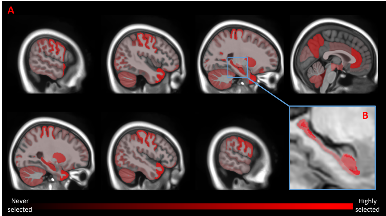
Figure 3: Representation of the most selected structures. The brain structures and hippocampal subfields are selected separately with the elastic net method. Frequently selected structures are colored red. (A) the most frequently selected brain structures are the temporal lobe, the postcentral gyrus, the anterior cingulate gyrus, the hippocampus and the precuneus. (B) the most frequently selected hippocampal subfields are the CA1-SP, the CA1-SRLM, and the subiculum.

in comparison to hippocampus grading. Thus, the use of hippocampal subfields selected with the elastic net method slightly increases the prediction performance of AD compared to the union of all subfields or the whole hippocampus. Furthermore, the edges selected by the elastic net do not improve the prediction performance compared to other hippocampal features. Finally, the proposed method combining edges and vertices improves the AUC by 1.4 percent points and the accuracy 4.4 percent points compared to the global hippocampus grading. Our graph-based method also improves the AUC by 1.1 percent points and the accuracy by 3.6 percent points when compared to the use of the most discriminant hippocampal subfields. Moreover, in both cases, our proposed graph-based method has a higher sensitivity.