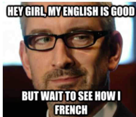
Figure 1. Meme Featuring Jean-Martin Aussant, the 2012 Option Nationale Leader.