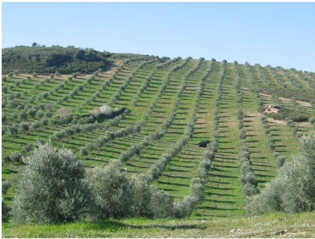
Fig. 1 Organic olive groves in Andalusia (S Spain)

food in public places such as schools and hospital. Additionally, the Rural Development Plan for (2014–2020) foresees a separate measure to recognise the importance of organic farming for the contribution of many rural development priorities and support both conversion and maintenance of organic farming.