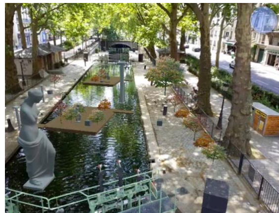
Fig. 7. Augmented scene result evaluation test height and ground tracking from bridge, Canal Saint-Martin, Paris, photo: June 2020.