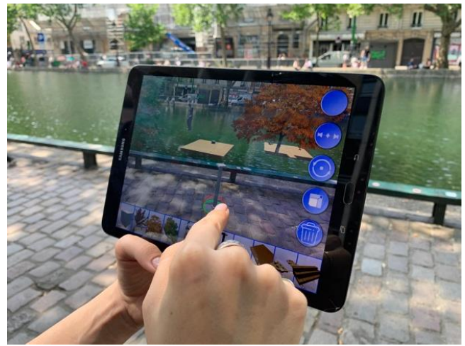
Fig. 5. ARtect scene evaluation test non-stable surfaces, e.g. river, Canal Saint-Martin, Paris, photo: June 2020.

We, partially, evaluated the application, since we did not have the opportunity to test it with students in architecture, we obtained some feedback, which was positive, from four students in visual arts and cinema that witnessed the experiment. Particularly, they mentioned that it was interesting to create a virtual scene directly on-site and then being able to walk through it, as they characterized the application highly immersive. Besides, the participants mentioned the potential of digital scenography since there is the capacity to place many different objects and interact with them. However, further tests are needed to be able to measure the usability and effectiveness of this instrument.