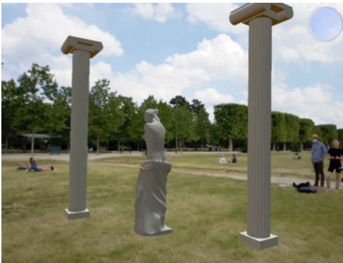
Fig. 9. AR scene, Back view of Venus of Milos.