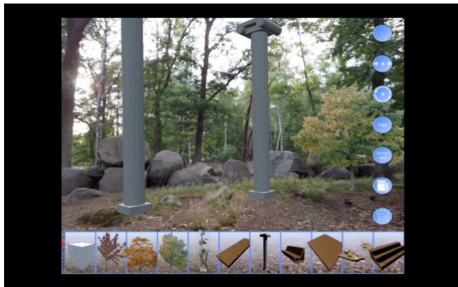
Fig. 4. ARtect interactive interface, personal Object Digital Library (bottom) and toolbar (right).