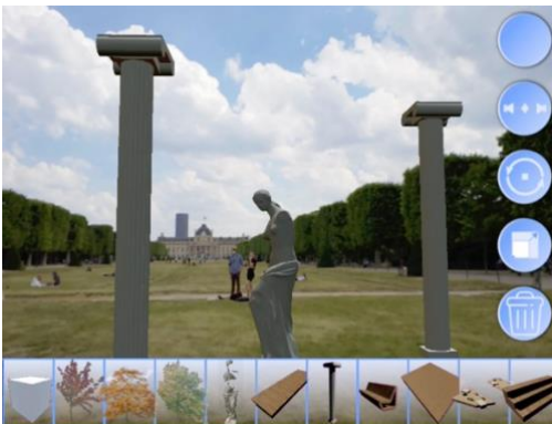
Fig. 10. AR scene Left view of Venus of Milos, Placement of 3D objects and the possibility to walk through the scene, Eiffel Tower.