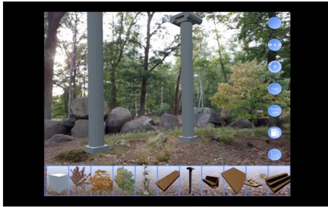
Fig. 4. ARtect interactive interface, personal Object Digital Library (bottom) and toolbar (right).