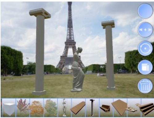
Fig. 8. AR scene, Right view of Venus of Milos [16].