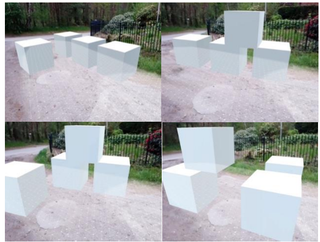
Fig. 1. ARtect prototype, AR Grid and examples with snapping cubes.

The participant can modify (move, rotate, scale, copy) the prefabricated standard geometry and use it as an augmented unit of construction. Furthermore, the user can select the measurement tool to calculate distances horizontally and vertically between points (Fig.2).