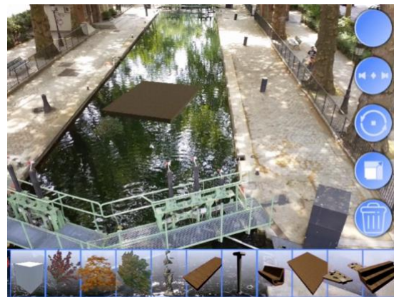
Fig. 6. ARtect scene evaluation test height and ground tracking from bridge, Canal Saint-Martin, Paris, photo: June 2020.