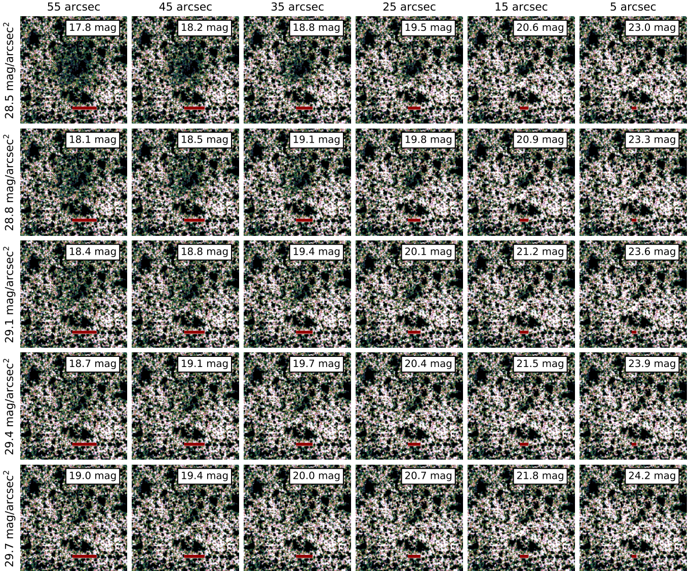
Fig. 2. Injected artificial dwarf galaxies. The effective radius and the effective surface brightness are varied in the horizontal direction and the vertical direction, respectively. The red line indicates the effective radius for each artificial galaxy. The number in the box represents the total apparent magnitude of the artificial galaxy. The images are smoothed with a Gaussian kernel with \sigma = 2 px to enhance the LSB features. The brightness of the stamps is represented with a cube helix color scheme (Green 2011).

surface brightness of 29.1 \text{ mag arcsec}^{-2} in the V -band, the artificial dwarf galaxies become indistinguishable from the background. This is similar to the surface brightness limit we estimated previously.