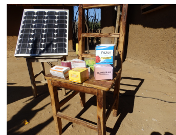
Source: informal market in rural area (including the PiPlan - contraceptive pill)

How, in this context, can women and professionals be given access to information on the appropriate use of misoprostol to reduce risks?