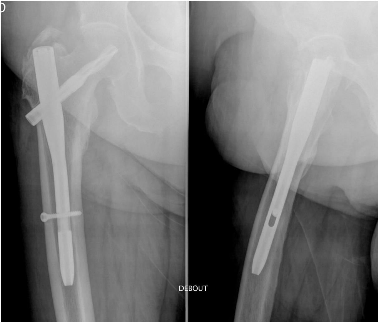
Figure 1: TFP nail