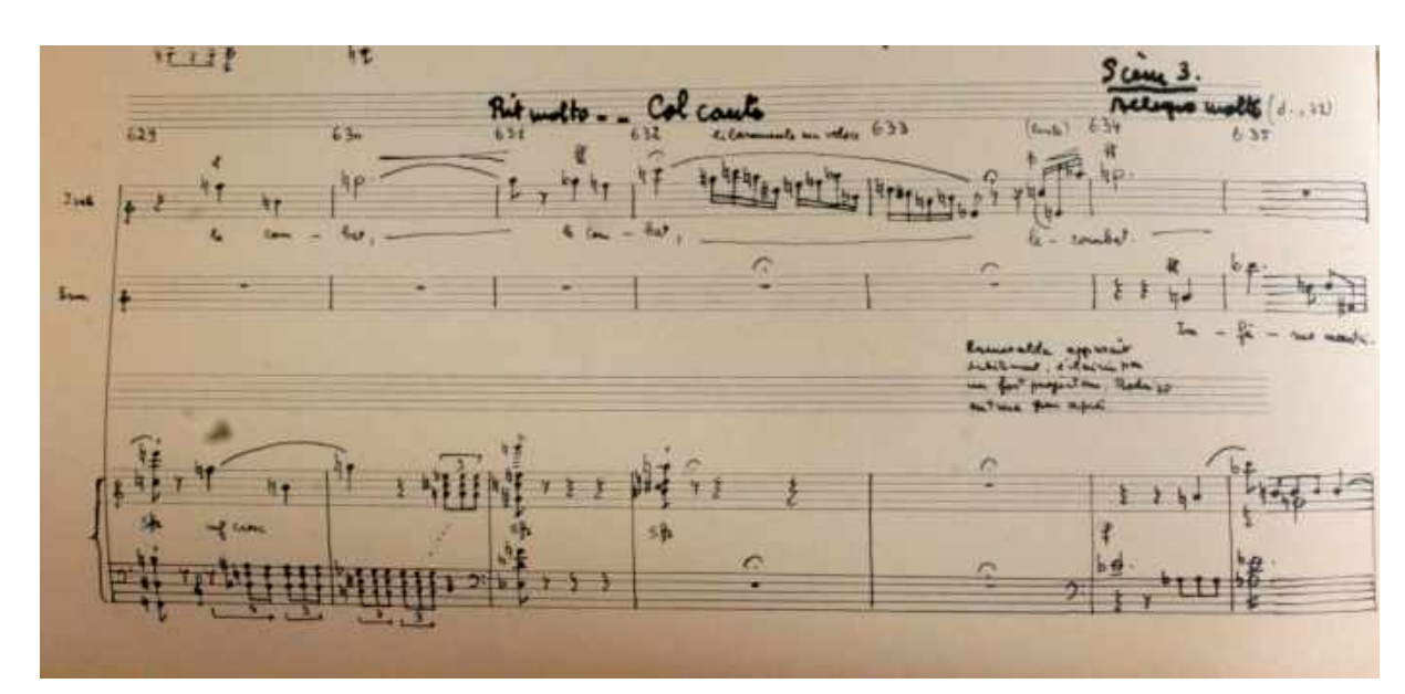
Example 5. Leibowitz, Todos caerán, vocal score: Act II, Deuxième Tableau, Scene 2, bars 629-34.

of collective action to leave room to bel canto solos gives grand opéra its characteristic dramatic thrust, Todos caerán seeks to achieve the same thing by way of dodecaphonic bel canto , as when Isabella's vocal line hints chromatically at C major, on the words " le combat " ("the fight"; see Example 6).