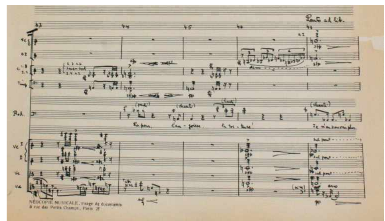
Example 2. Leibowitz, Todos caerán, orchestral score: Act I, Premier Tableau, Scene 1, bars 44-6.

Expressionist orchestral idiom - sometimes infiltrated by chamber-like sonorities, as in Isabella's first aria with bass clarinet and cello solo obbligati - and the alternation of lyric, Sprechgesang and parlato vocal techniques (as in Rodrigo's outburst; see Example 2).