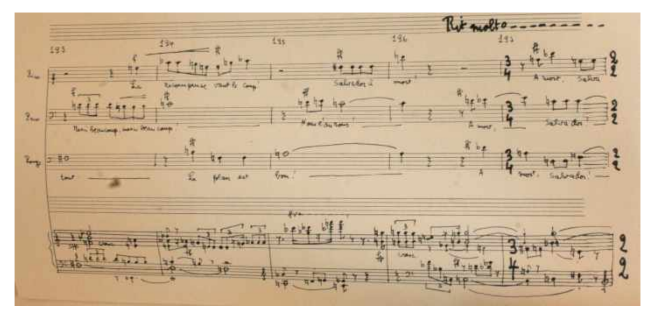
Example 4. Leibowitz, Todos caerán, vocal score: Act I, Premier Tableau, Scene 2, bars 193-7.

This web of classical references is only partially unified by bel canto, for the classical melodic impulse is inflected by Viennese-school features such as huge intervallic leaps (ninths, tenths, and more) and the general avoidance of closure. The only exception is the thematic function of major thirds in the characterization of Pico, Paco and Pongo, as a reminiscence of Turandot 's lighter, operetta-like register (see Example 4).