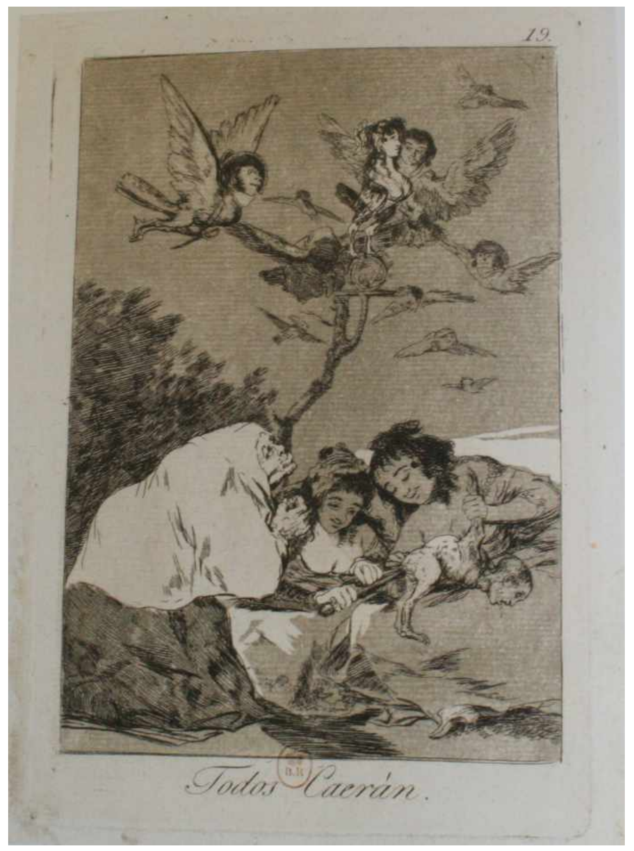
Figure 1. Francisco de Goya, Todos caerán (Los caprichos no. 19)

"The action is set today in an imaginary island", says the score. The work stages a right-wing dictator, Salvador (bass), backed by the Army and the Church, and a