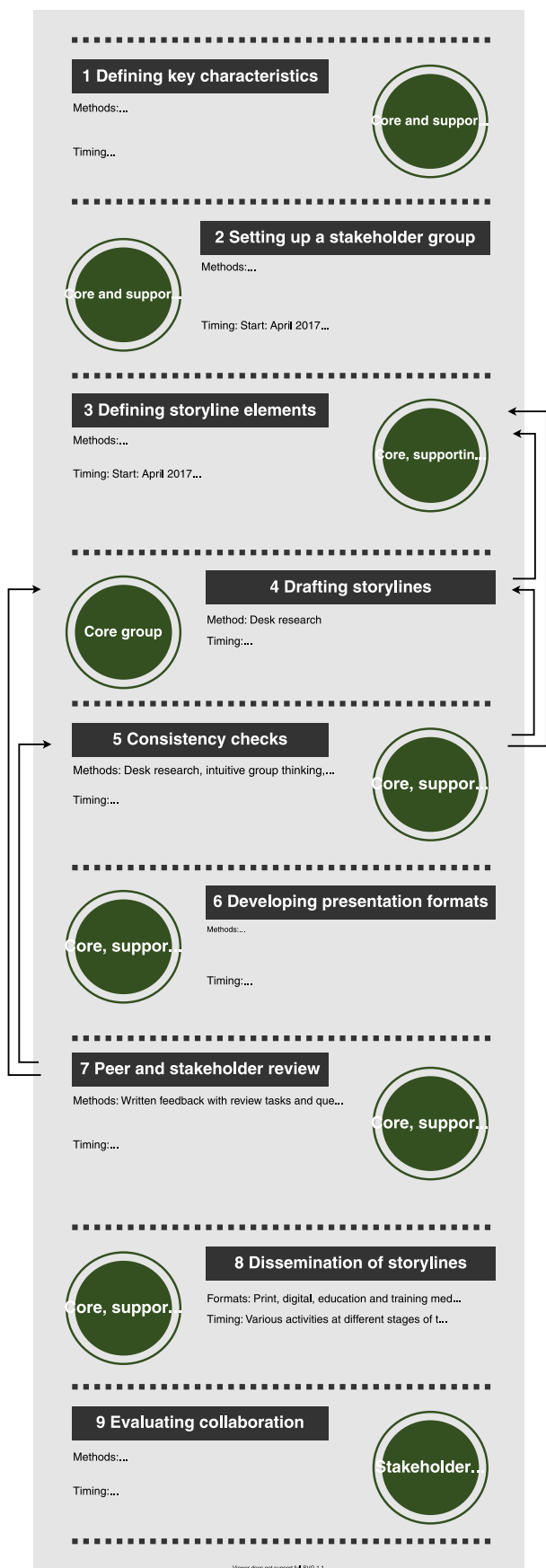
Fig. 1. Overview of the research process based on the nine working steps defined in the protocol by Mitter et al. (2019). Notes: For each working step (grey rectangle), the scenario working groups involved (green circles), the applied methods and the timing are given. The arrows indicate that the research process was iterative, i.e., some working steps were repeated until the final Eur-Agri-SSPs were developed. (For interpretation of the references to colour in this figure legend, the reader is referred to the web version of this article.)

data and resources. Additional information and material for specific working steps is provided in the Supplementary Material (SM II) .