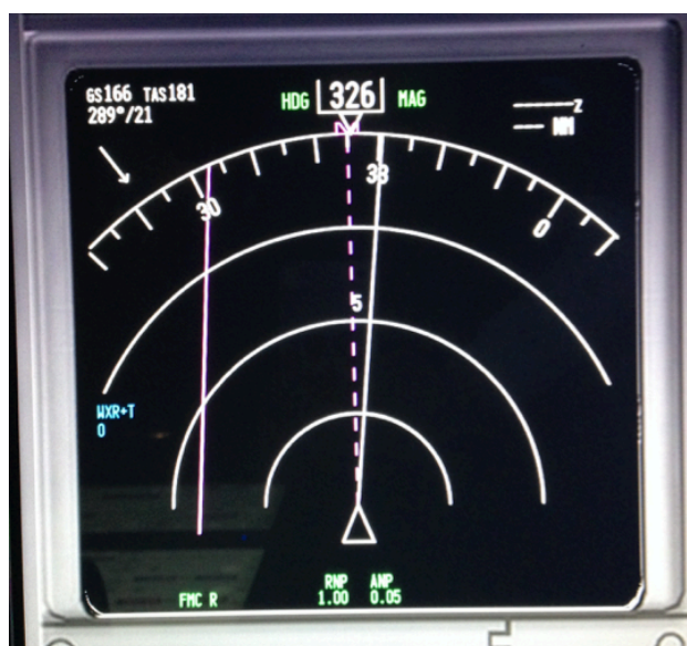
Figure 2. Classical commercial aircraft's navigation display. The left vertical line is the initial trajectory. The right one is the offset. The pilot estimates the distance between these two lines, here about 3 NM.

At this point, it is important to explain what we mean by complexity. First, the opposite concept of complexity is not simplicity, but familiarity. When we are moving from one place that we know well to another region of the world, one way or another, we always find this new place complex and difficult to handle. However, after a few months of stay, we start to be familiar with lots of details that were not salient, and sometimes not perceived at all, in the beginning. We become familiar with the environment. Familiarity decreases the perceived complexity of this new place. In other words, the emergent mental model increasingly becomes more familiar to the observer. We will see later that once this "familiar" mental image of the situation is learned, it depends on the way people use it (i.e., it could be located at the sub-conscious level or the conscious level of the brain, and sometimes embodied in our senses). Professional dancers, for example, learned through intensive training to embody jumps, spins and pirouettes, so they do not think about at a conscious level to execute these kinds of movements. They concentrate on more complex endeavors.