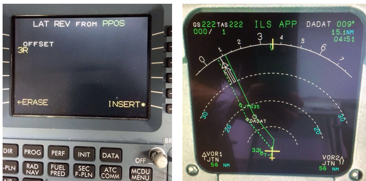
Figure 3. (Left picture) The pilot enters "3R" on the user interface of the FMS under the prompt "OFFSET", and selects "INSERT"; (Right picture) The navigation display shows the initial trajectory (dotted line) and the offset trajectory (plain line).

Let's take a real world example in commercial aviation. When air traffic control asks the aircrew to offset 3 NM on the right from their trajectory, on classical commercial aircraft, the pilot typically manually turns the heading knob to the right until the 3 NM offset is reached and re-establish the original heading. This is an embodied gesture (Figure 2). Conversely, in modern automated cockpits, the same maneuver is performed using the Flight Management System (FMS). The pilot enters "3R" (i.e., 3 NM offset on the right) on the flight plan page (Figure 3). The FMS computer (considered as an artificial agent) automatically takes the requested offset and re-establishes the original heading. In this case, the pilot delegates the offset task to the FMS agent. This is a cognitive act. In these two cases, SA is not managed in the same way. In the former case, the pilot has to estimate that the offset is reached by monitoring the evolution of the aircraft on the navigation display (ND). This monitoring is not a difficult task, but it is not as accurate as what an automated system can do. The SA process should take into account aircraft inertia for the estimation of the offset on the ND. In the latter case, the pilot does not have to worry about this estimation because it is entirely done by the system, including inertia management. We see that in modern cockpits SA has to be thought as a human-systems multi-agent activity.