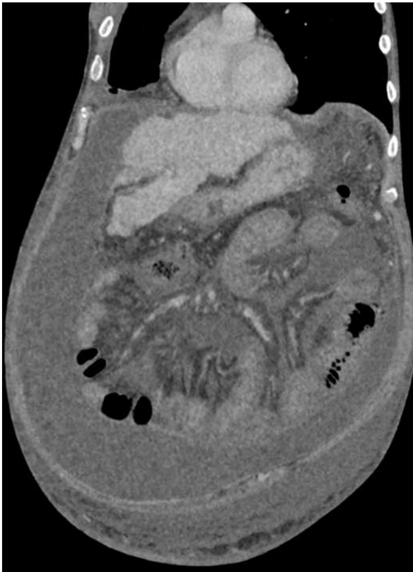
Figure 1. Click here to download high resolution image