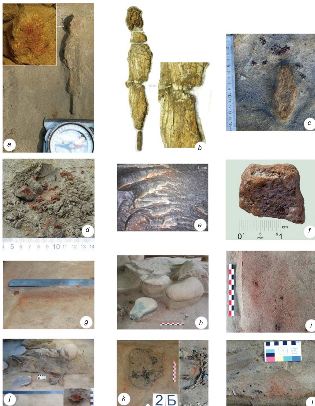
Fig. 3. Ocher among other cultural artifacts from layers 6 ( a–d ), 2G ( f–i ), and 2B ( j–l ).

a – the first anthropomorphic mammoth ivory figurine in layer 6 in the course of discovery; ocher traces on the “head”; b – same figurine during restoration: ocher traces on the lower surface; c – the second anthropomorphic mammoth ivory figurine in layer 6 in the course of discovery: ocher pieces close to the “head”; d – decomposed ocher piece; e – ocher traces on the ventral surface of a knife; f – hematite piece with rounded edges; g – ocher at the bottom of the cultural layer; h – ocher below the hearth construction; i , k , l – ocher coloration of layer; j – ocher piece next to a split tubular bone at the western margin of hearth.