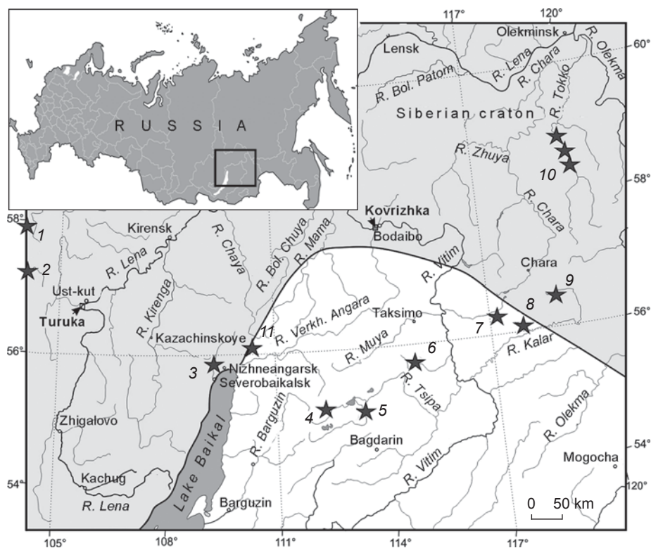
Fig. 1. Location of the Kovrizhka IV site, Turuka cemetery, and iron-ore deposits in the region. 1 – Rudnogorsk; 2 – Korshunovsky; 3 – Tyya group; 4 – Toldun; 5 – Taloy; 6 – Irokinda; 7 – Nizhny Ingamakit; 8 – Katugin; 9 – Chiney; 10 – Chara-Tokko group; 11 – Abchada group.

BH2-UMA ( \times 100 – \times 200 ), and Dino-Lite Digital Microscope Premier ( \times 30 – \times 250 ) showed occurrences of ocher on the surfaces of some artifacts. One of two retouched tools, typologically identified as a side-scraper and used as a knife, bears microscopic traces of ocher on the proximal part of its face, in a retouched and thinned area (Fig. 3, e). One of the anthropomorphic figurines,