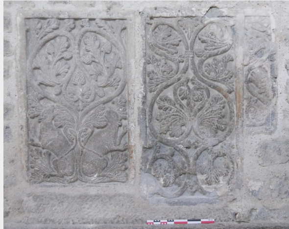
Saint-Geraud abbey church plates (end of the 11th century)