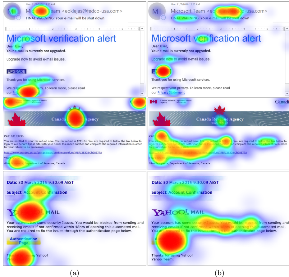
Fig. 3. Examples of trust-leading (a) and distrust-leading (b) areas in phishing emails

In this article, we consider the subset of 8 English emails in order to restrict the amount of data to process. Thus the collected data represents for each participant and each email, trust and distrust areas, meaning: (250 \times 8) \times 2 = 4\,000 images of emails with clicked areas. These images have been aggregated by the Qualtrics solution to 8 \times 2 = 16 heatmaps: 8 trust-leading areas images and 8 distrust-leading areas images. Figure 3 shows three examples of trust-leading and distrust-leading areas in emails. As outlined in the next section, the research team is now analysing such images, notably to find invariant elements used as trust or distrust givers by individuals, i.e. elements leading participants to decide to trust or to distrust.