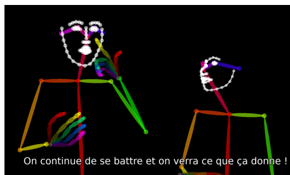
Figure 1: Frame from MEDI-API-SKEL

challenges appropriate for MEDI-API-SKEL.