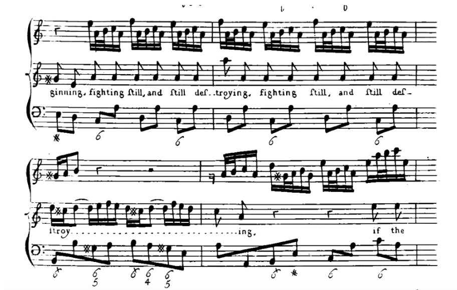
Fig. 2: Handel, Alexander's Feast , "War he sung is soil and trouble", mm.29-32. Ed. John Walsh, London, c. 1736

The octave leap in the second bar of this second occurrence can be heard as an additional return of the same A, but an A whose expressive content is altered by the subjective saturation that Burke derived from a repeated ominous sound – very much like in his account a cannon shot could bring “to the verge of pain”, despite its being identical to the precedent ones. Thus, in this air Handel’s musical depiction of war brings together objective and subjective traits of Burke’s temporal grammar of delightful horror.