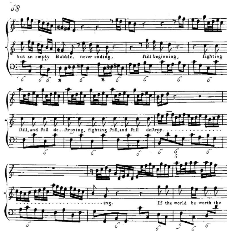
Fig. 1: Handel, Alexander's Feast , "War he sung is soil and trouble", mm.16-19. Ed. John Walsh, London, c. 1736.

repeated in crotchets over two measures, and prolonged by a long melisma over the -troying syllables. The first time (X) the repeated note is a C: