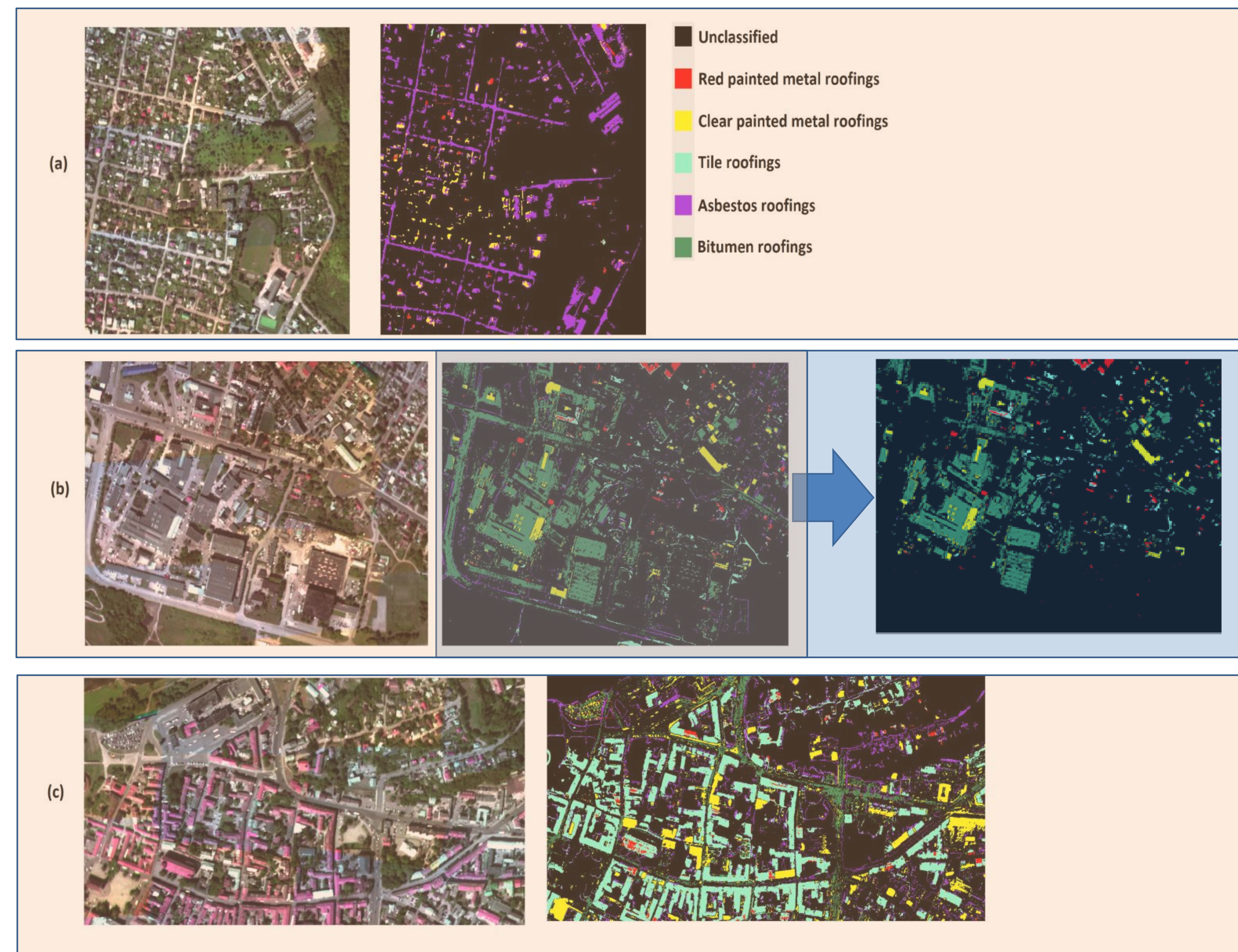
Spectral classification by spectral library of (a) residential zone, (b) industrial zone, and (c) historical center of Kaunas city.