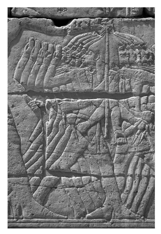
Fig. 6 Small Temple, Medinet Habu

stretched out under the traditional gathering of foes, wear ostrich feathers on their heads. Whether or not the artist intended to portray particular Libyans is difficult to say, but they must represent western foes.