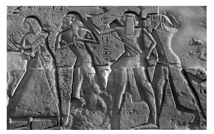
Fig. 5 Rameses III Temple, Medinet Habu

displays a type 1 Libyan pictured on the east side of the columned hall.<sup>94</sup> It recalls the triumphal scenes from Karnak and Abu Simbel, although here he is alone with the king. Indeed, in the NK both types are pictured quite close to each other.