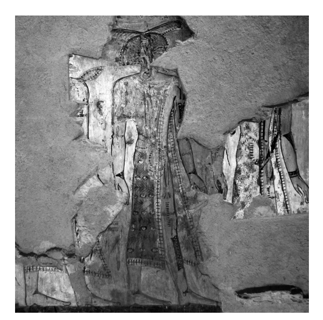
Fig. 2 Libyan in the scene of the "four races of mankind", Seti I Tomb (KV 17)

motif at its base, suggesting that either an adornment was fitted onto the hair or hairdressing was applied to the lock itself. The fact that sometimes the hair around the lock was shaved, may serve that purpose.<sup>45</sup> Occasionally, a double sidelock is seen on some Libyan chiefs, suggesting that the tress might have a rank or office signification.<sup>46</sup> Furthermore, the pointed beard is still systematically present. The ear rings are bigger and have more elaborate various forms.