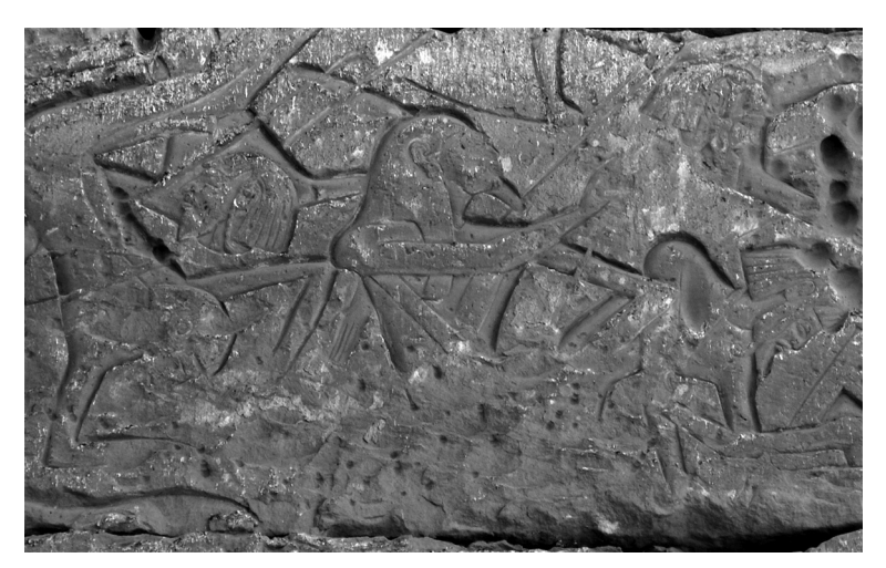
Fig. 4 Rameses III, Medinet Habu

The Evolution of Libyans' Identity Markers in Egyptian Iconography