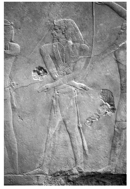
Fig. 1 Sahura Temple, Abusir, ÄM 21782

The crossbands and the collar surrounding the neck seem to have the same pattern, therefore they were probably made of the same fabric.<sup>9</sup> Both were most likely made of strings of beads. Besides, some colours maintained on one fragment from Pepy I's temple of the valley, show that the beads used for both the crossbands and the collar were green.<sup>10</sup> Different patterns are recognisable on the reliefs from the OK.<sup>11</sup> In the main scene of the tribute's presentation from Sahura's temple, the crossbands worn by all the subjects are made of three lines, the two exterior ones having a decoration with little circles, while the middle one is ribbed. These people are not prisoners, they raise their arms as a sign of humble adoration (forcibly or not), bringing their cattle to the