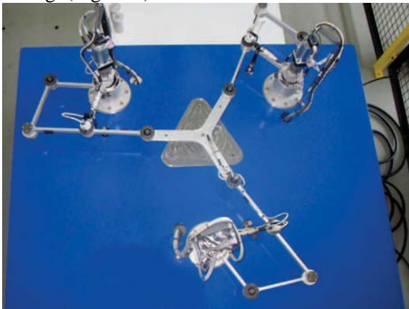
Fig. 1: The NAVARO prototype

A drawback of serial and parallel mechanisms is the inhomogeneity of the kinetostatic performance within their workspace. For instance, dexterity, accuracy and stiffness are usually bad in the neighbourhood of singularities that can appear in the workspace of such mechanisms [1]. Nevertheless, it is difficult to come up with a large operational workspace free of singularity.. As the singularity loci depend on the actuation scheme, the NaVARo has eight actuation modes thanks to three double-clutch systems located at the first revolute joint of each leg. (Figure 1).