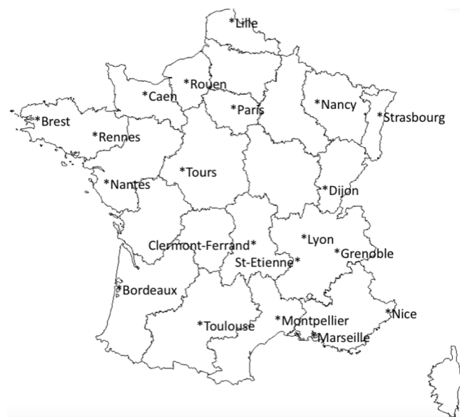
Figure 1 Distribution of participating centres across France.

A disaster plan AMAVI with a specific paediatric emphasis was established in all the paediatric centres (n=27, 96%) excluding the one which did not admit patients with trauma. In case of a mass casualty event, paediatric victims would be initially admitted to the paediatric ED for most centres (n=21; 75%), with some admitting initially to the paediatric ICU (n=3; 11%) or the