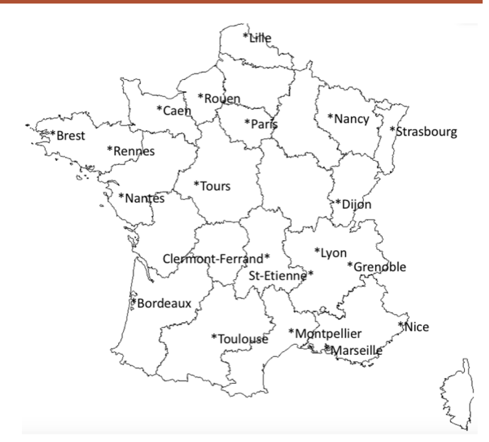
Figure 1 Distribution of participating centres across France.

A disaster plan AMAVI with a specific paediatric emphasis was established in all the paediatric centres (n=27, 96%) excluding the one which did not admit patients with trauma. In case of a mass casualty event, paediatric victims would be initially admitted to the paediatric ED for most centres (n=21; 75%), with some admitting initially to the paediatric ICU (n=3; 11%) or the