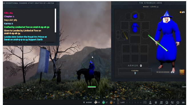
Figure 2. A We Ride player-character sits on a horse next to an honor banner , wielding a historical staff whose narrative lists: kills, chapter, age in real time, karma and story events in chronological order (upper left panel). Right panel shows the Character portrait.

We defined the following story event types; owner change —a weapon is traded or looted, player kill —a player kills another player,