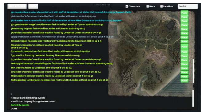
Figure 3. Story monitoring interface. Filtered story events with output log below (left). A worldmap (right) with buttons for placing an honor banner based on a story event. Searchbox and parameters for filtering (top).

Impact is also connected to a ‘raiding system’. If players accumulate a high impact level by consecutively defeating a race’s dispatched hunters, the system will generate an ‘outpost’ which marks the player’s last known location with a banner from where NPCs then continue to spawn. If the outpost is close to a friendly city and left undefeated, it triggers a raid. NPCs will gather and start to march on the city from two opposite directions. They will seize the city, unless players collaborate to defend it. If the city is besieged, friendly NPCs despawn and are replaced by the attackers. A city can only be reclaimed by defeating the race’s leader.