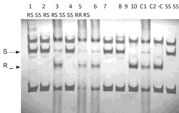
Fig. 3. Single strand conformation polymorphism for the determination of Rdl genotypes of Myzus persicae . The profiles obtained from ten individuals are shown, together with those for two reference plasmids, C1 and C2 corresponding to the rdl and sdI alleles of the Rdl1 locus, respectively (see text for details). A negative control (-C), corresponding to PCR without a DNA template is also shown. RR, RS and SS correspond to the rdl/rdl , rdl/sdI , and sdI/sdI genotypes, respectively. S and R indicate the sdI and rdl allele-specific bands, respectively.

trees of the autumn 2001 sample at Avignon (Fisher's exact test, P > 0.05 ). The reference clones SUS, COL and AV were kds/kds , kdr/kds , and kdr/kdr , respectively; LYON was kdr/kds and BIA was kds/kds .