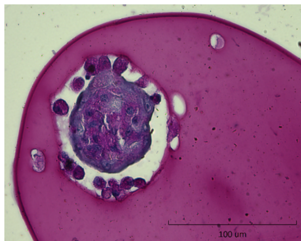
Fig. (2). Hepatic spheroid encapsulated in an alginate bead. The spheroid was formed by the aggregation of hepatocytes and hepatic non-parenchymal cells. The image shows PAS staining that indicates cellular glycogen storage.

In conclusion, these preliminary clinical trials have confirmed the potential ascribed to islet microencapsulation technology and its resulting positive outcome in terms of safety. However, these results could not be effectively exploited because of the lack of reproducibility in the different centers. It is clear that further attention still needs to be given to certain critical technical aspects involved in the production of alginate beads [102]. This would make it possible to establish general optimal criteria for providing ultrapure alginate beads that, whether coated with polyamines or not, could be well-tolerated by recipients. The size and morphology of the beads needs to be carefully designed in order to improve functional performance (smaller size) and minimize the risk of macrophage signaling (smooth surface and absence of cell protrusion). The choice of implantation site perhaps requires additional revision so that the high oxygen requirements of pancreatic islets can be better fulfilled and their functionalities preserved longer.