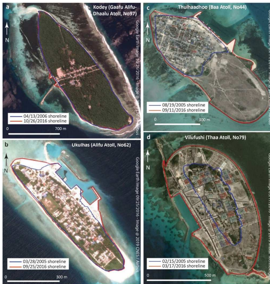
387 388 Figure 3. Patterns of change on inhabited islands.

376 Kodey; Figure 3a). These islands represent 36.7% of the inhabited islands affected by land 377 reclamation. Second, islands exhibit a moderate to significant ( 3\% \leq x \leq 10\% ) gain in land area, 378 which represent 26.7% of reclaimed islands. Third, islands exhibit a marked areal gain (e.g. 379 +17.9% for Ukulhas; Figure 3a) due to extensive land reclamation associated with harbor 380 dredging. These islands represent 22.2% of reclaimed islands. Fourth, islands exhibit total 381 transformation in shape, size and sometimes position on the reef flat, following extensive land 382 reclamation, like Thulhaddhoo and Vilufushi (Figures 3c and 3d). These islands are present in 383 nine atolls and represent 14.4% of inhabited islands affected by land reclamation. 384 Thimarafushi (Thaa Atoll, No 75) was considerably extended for airport construction between 385 2010 and 2012 (+76.8 ha, from 20 ha in 2005 to 96.8 ha in 2016), for example, which led to 386 the incorporation of the nearby islet of Hiriyanfushi.