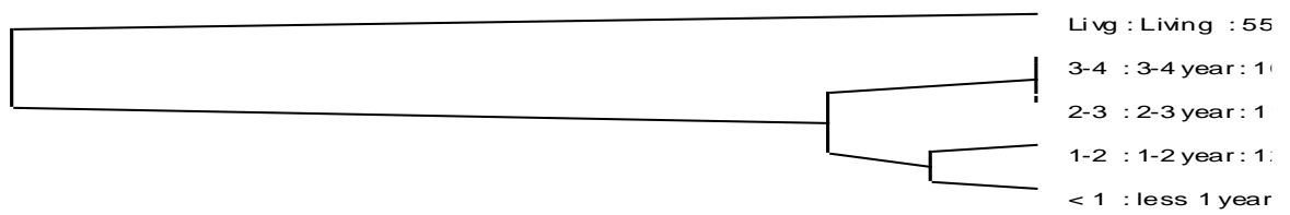
Fig II. Hierarchical Tree of the life span of the firms according to the theme "Context of entrepreneurship".