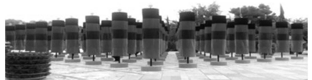
Fig. 5. Installation of sculptures at ritual and religious events (Moharram and Safar) in Mellat Park by Mojtaba Mousavi

Tehran municipality has ordered the installation of statues and sculptures in different regions of Tehran, temporarily or permanently, on different occasions, such as the beginning of the year, the anniversary of the Islamic Revolution (Fajr decade), or ritual and religious events (Moharram and Safar), and Ramadan (fig. 5). With regard to the macro structure of Tehran, different public spaces such as roadsides of highways and loops have been selected for the installation of stand-alone sculptures or group compositions (fig. 6). Table 1 presents the statistical data on sculptures installed in different Municipal districts of Tehran and the periods of their installation.