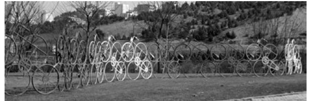
Fig. 6. Installation of Bicycles sculptures in highways and loops (in Hemmat Highway) made by Ashraf Karimi

The most important act of vandalism in this regard happened in 2011, when 9 statues in Tehran disappeared. These statues were located in crowded places and weighed between 100 to 400 kilograms and their height was in the range of 1 to 6 meters. Information on these statues is presented in Table 2.