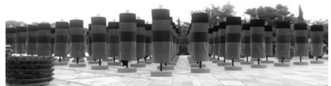
Fig. 5. Installation of sculptures at ritual and religious events (Moharram and Safar) in Mellat Park by Mojtaba Mousavi

Tehran municipality has ordered the installation of statues and sculptures in different regions of Tehran, temporarily or permanently, on different occasions, such as the beginning of the year, the anniversary of the Islamic Revolution (Fajr decade), or ritual and religious events (Moharram and Safar), and Ramadan (fig. 5). With regard to the macro structure of Tehran, different public spaces such as roadsides of highways and loops have been selected for the installation of stand-alone sculptures or group compositions (fig. 6). Table 1 presents the statistical data on sculptures installed in different Municipal districts of Tehran and the periods of their installation.