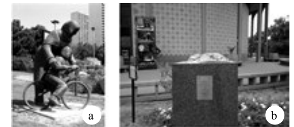
Fig. 7. Two of the stolen statues in Tehran in 2011 (a) Bronze sculpture of Mother and child (b) Bronze head statue of Shahryar

The characteristic of art and politics is influencing public opinion and in this field, each of them wants more desirable conditions to maximise their benefits. The government as the only power of the political sovereignty in Iran determines the economic and social aspects of urban art– sculpture in particular. In this article, the process of change in urban sculpture during the years before the revolution and afterwards is analysed with the empha-