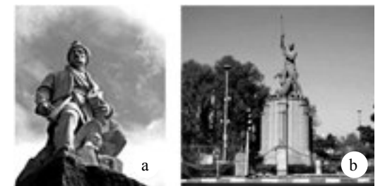
Fig. 2. (a) Statue of Firdowsi made by Abo'l-Hassan Khan-e Sedighi; (b) the struggle between right and wrong (The battle of Garshāsb and the Dragon) made by Arzhang Rahimzadeh.