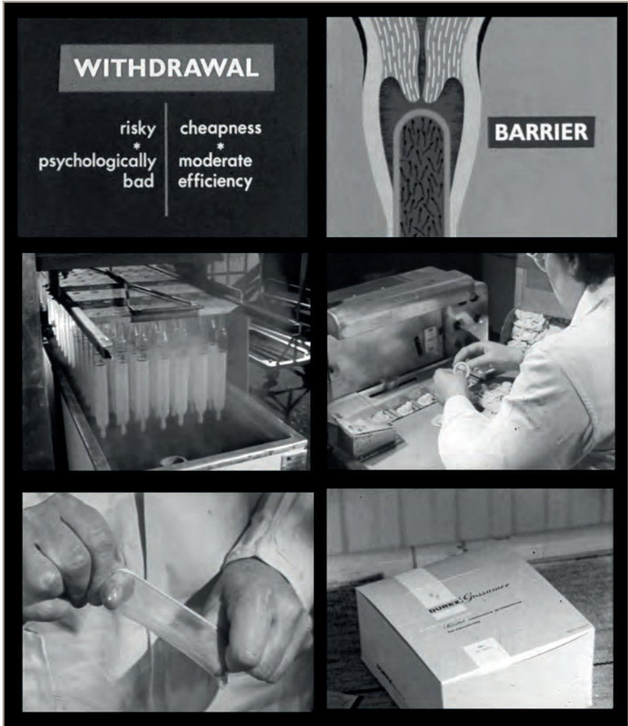
Figure 4 - The benefits of the technologically advanced condom against, for example, the withdrawal or coitus interruptus contraceptive technique in According to Plan