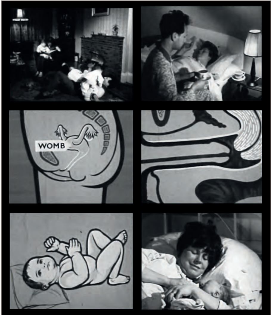
Figure 2 - A focus on the inter-relatedness of happy family life with reproduction in Learning to Live