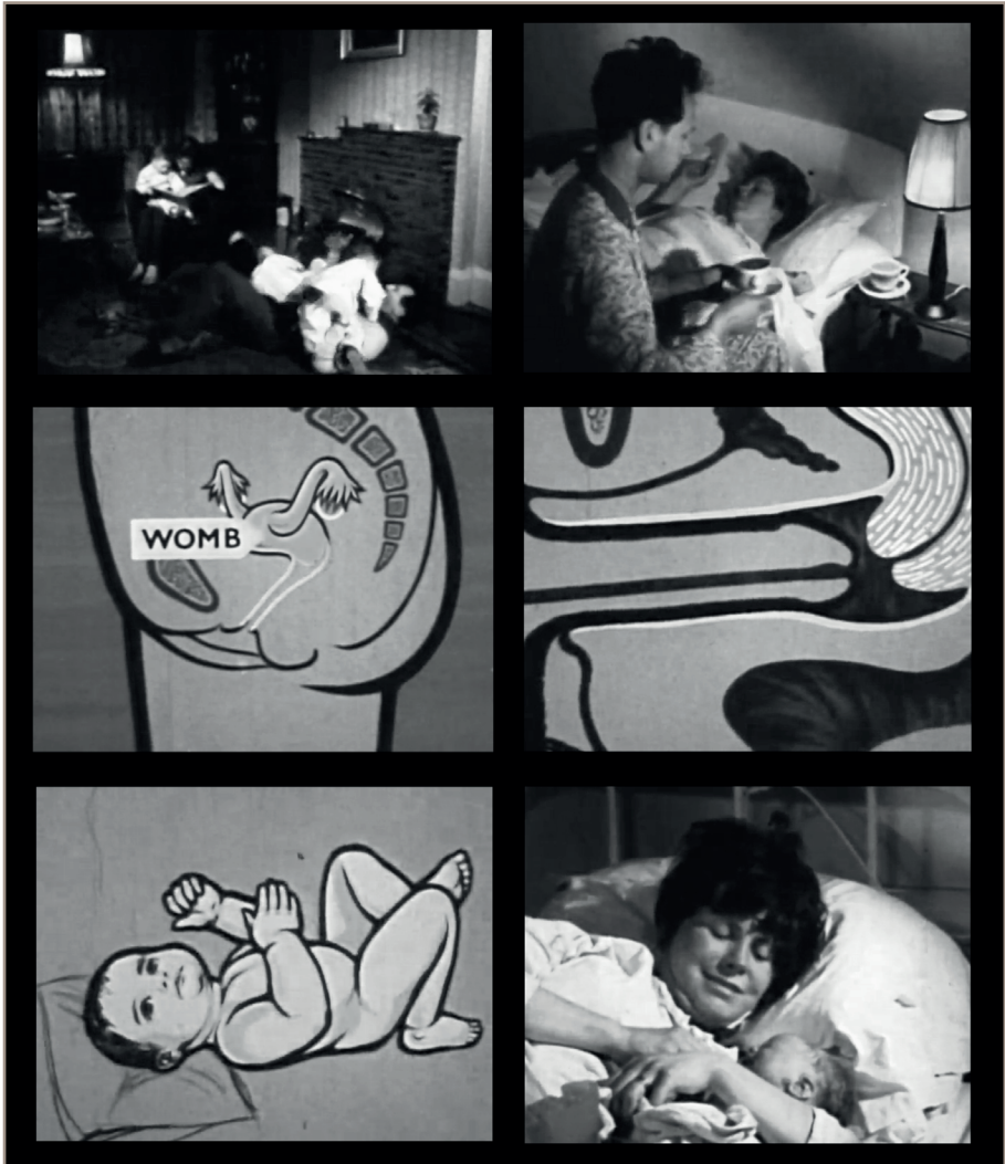
Figure 2 - A focus on the inter-relatedness of happy family life with reproduction in Learning to Live