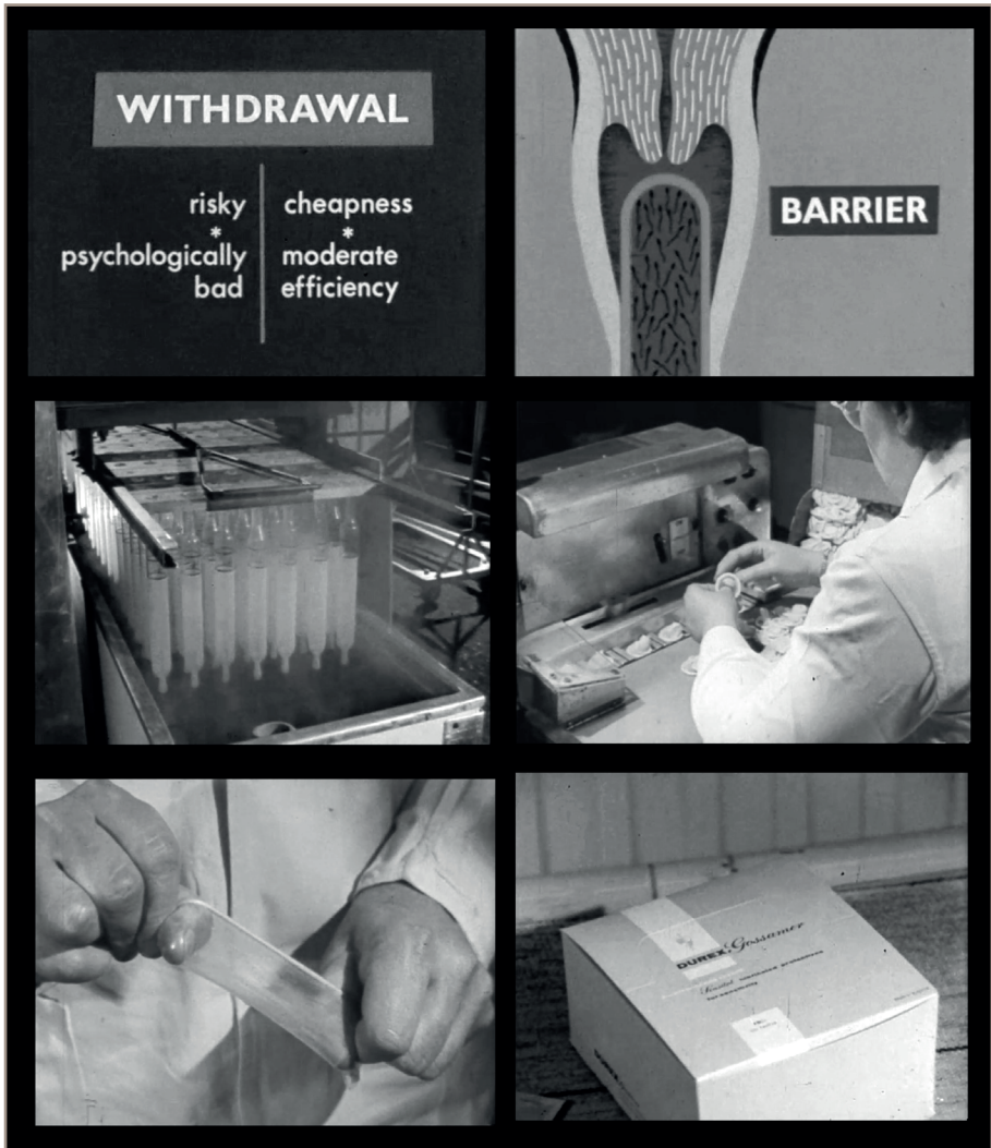
Figure 4 - The benefits of the technologically advanced condom against, for example, the withdrawal or coitus interruptus contraceptive technique in According to Plan