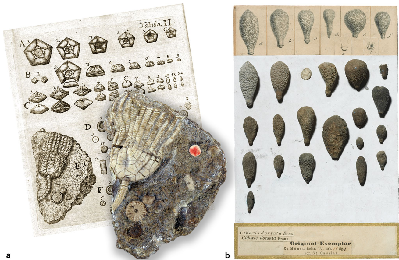
Fig. 2 Historically, numerous private collections form the basis of the palaeontology collections of our larger natural history museums—for example, in Berlin and Munich: a The holotype (MB.E 85) of the German ‘Muschelkalk’ crinoid Chelocrinus schlotheimi (Quenstedt, 1835) [specimen length ~5.5 cm] from the former private collection of Ernst Friedrich von Schlotheim (1764–1832) at the Berlin Naturkundemuseum was first part of other older private collections (Michael Reinhold Rosinus in Hann. Münden, 1687–1725;

The SVP letter recommends that editors should add the following to their policies: “Any fossil specimen that is described or illustrated in a manuscript intended for publication must be formally accessioned into a permanent, accessible repository, where the specimen will be available for study by the scientific community. Long-term loans from private individuals or private organisations to repositories