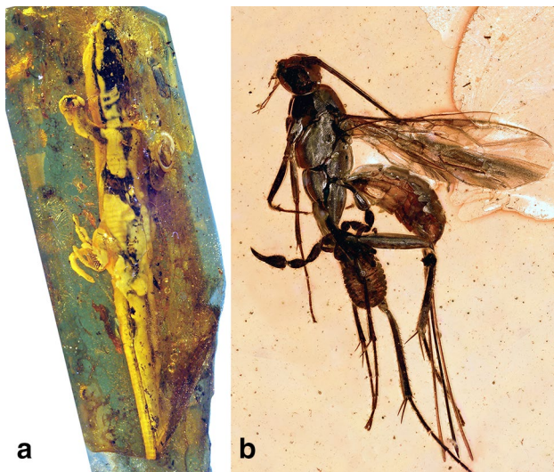
Fig. 1 Numerous unique fossil specimens and type material were at the time of the first scientific description in private ownership and came only into public collections after the death of the private collectors. a The iconic ‘Königsberg amber lizard’ Succinilacerta succinea (Boulenger, 1917) [specimen length ~4.2 cm] from the private amber collection of Richard Klebs (1850–1911). First described by George Albert Boulenger in 1917 and purchased by the Prussian State and the former Königsberg Albertus University in Königsberg in 1926; today, the holotype is deposited in the Göttingen Geoscience collections (GZG.BST.15000; see Reich 2008b). b This intriguing piece of Baltic amber with a male pseudoscorpion ( Oligochnes bachofeni Beier, 1937) latched onto an ichneumonid wasp [specimens length ~9.3 mm] comes from the private collection of Adolf Freiherr Bachofen von Echt (1864–1946). It shows one of the first fossil examples of a phoretic relationship between pseudoscorpions and insects and was figured in numerous textbooks and other works. A large part of the Bachofen-Echt amber collection was purchased by the State of Bavaria in 1958, and the specimen is today part of the Munich Palaeontology collections (SNSB-BSPG 1958 VIII 195; see Reich and Wörheide 2018)

professionals. In palaeontology, they provide material (Fig. 1) and crucial information on many different groups, for example: