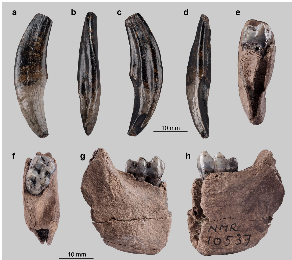
Fig. 4 The Netherlands is one example of a country with a strong tradition of fruitful collaborations between private collectors and professional palaeontologists, leading to important scientific discoveries such as specimens of the Barbary monkey Macaca sylvanus (Linnaeus, 1758) from Maasvlakte 2, Rotterdam, The Netherlands (Pleistocene; see Reumer et al. 2018). a–d Left upper canine tooth (C sup. sin.) found by and in the collection of Mr. Henk Houtgraaf, Papendrecht (The Netherlands), inv. nr. HHO-0420. a Buccal view.

b Anterior (mesial) view. c Lingual view. d Posterior (distal) view. e–h Right mandibular fragment with the lower third molar (M3 dex.) preserved, found by Mr. Cock van den Berg, collection of the Natural History Museum Rotterdam, inv. nr. 999100010537. e Anterior (mesial) view. f Occlusal view. g Buccal view. h Lingual view.