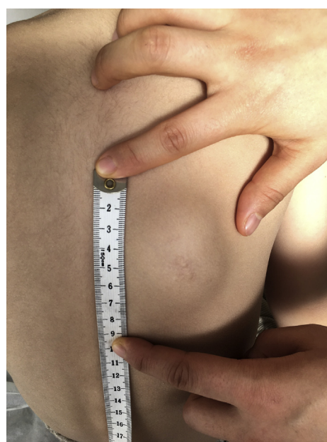
Fig 1. Skin-colored mass localized on the right side of the back of a 3-year-old child.

IMH: intramuscular hemangioma NICH: noninvoluting congenital hemangioma