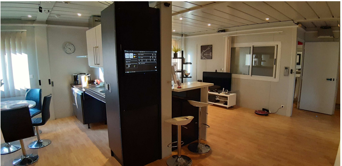
Figure 3. The Blagnac smart home.

The Blagnac smart home is a Living Lab-type technology platform used for the design and assessment of health and home support technologies (Figure 3). This platform is showing a good sample of existing technological solutions to achieve home security, comfort, communication and assistance, for the disabled people, with a special focus on disability in the senior population. These technologies include sensors for measuring ambient parameters or for domestic safety, assistance devices (pillboxes, automatic lighting, guidance systems, automated opening systems, etc.), fall detection and geolocation devices, mobility aids, motorized furniture (adjustable in height), etc. A Wizard of Oz type platform [13] allows participants to experience voice control when it is not actually implemented for a said functionality.