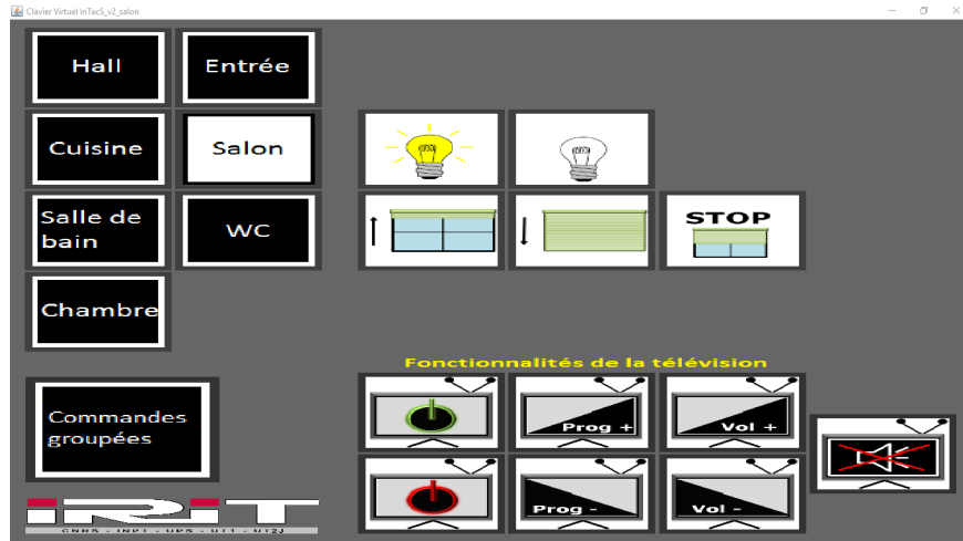
Figure 4. The tactile interface InTacS.

After the demonstration, the residents performed a scenario of getting up and having breakfast, then a scenario of television use. The touch controls were in real operation, the voice control was simulated by a Wizard of Oz. The starting point of the scenario was given by a researcher, the end was decided by the volunteer when he or she considered the task completed or failed.