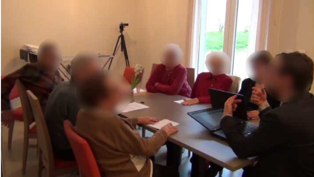
Figure 5. Focus group within the Montredon shared house (5 participants and focus group facilitator and session secretary).