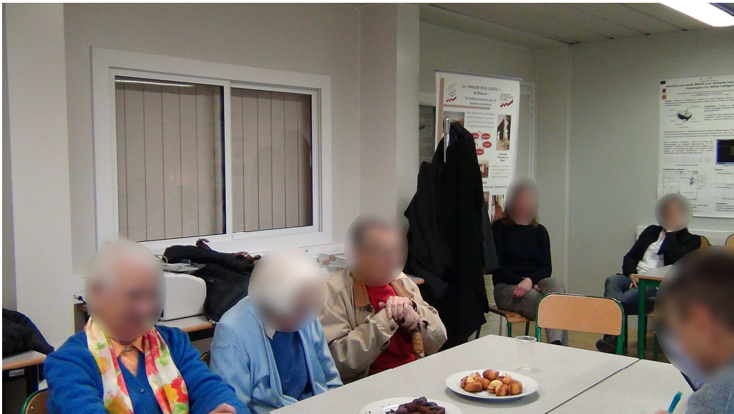
Figure 6. Focus group (3 participants) in the Blagnac smart home.

During the focus group at the Blagnac smart home (Figure 6), we noticed an evolution of participants' perceptions of the use of interaction techniques, including the voice interaction which use was presented in the scenario. Compared to the focus group held at the Montredon shared house, the discussion focused more on the tension between the physical action of the human being (resident) and that of the technique in terms of keeping fit. The risk that excessive ease of interaction could lead to conflicts between residents was also mentioned, as well as the important role of mediation of the assistants in maintaining the cohesion and harmony of the group. Consensus needs fall in four categories: