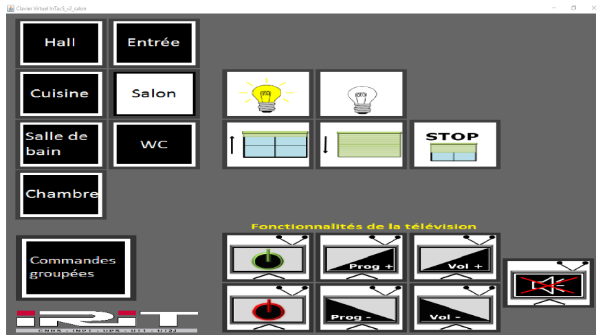
Figure 4. The tactile interface InTacS.

After the demonstration, the residents performed a scenario of getting up and having breakfast, then a scenario of television use. The touch controls were in real operation, the voice control was simulated by a Wizard of Oz. The starting point of the scenario was given by a researcher, the end was decided by the volunteer when he or she considered the task completed or failed.