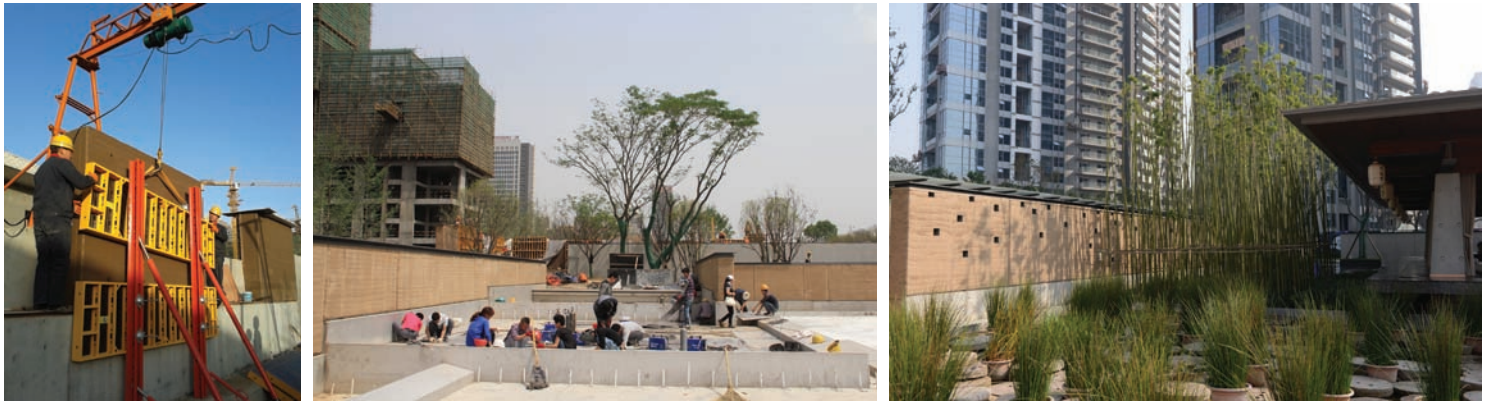
Fig. 8 Vanke landscape project with rammed-earth, Xi'an