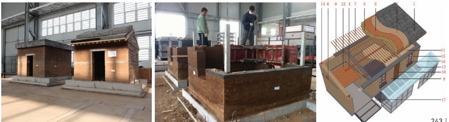
Fig. 5 Improved structural system and models for shaking-table experiments

Convinced by the prototype's performance, all 12 families in Macha village, who were granted the opportunity to renew their housing in 2013, decided to opt for the new rammed-earth construction technologies. Equipped with the guide, design proposals and more importantly, empowered through their active participation in the construction of the prototype, the families built their own houses over a period of three months. It came as a surprise that villagers clearly showed their creativity and wisdom as designers and builders. After all, they knew best about their own lives and needs.