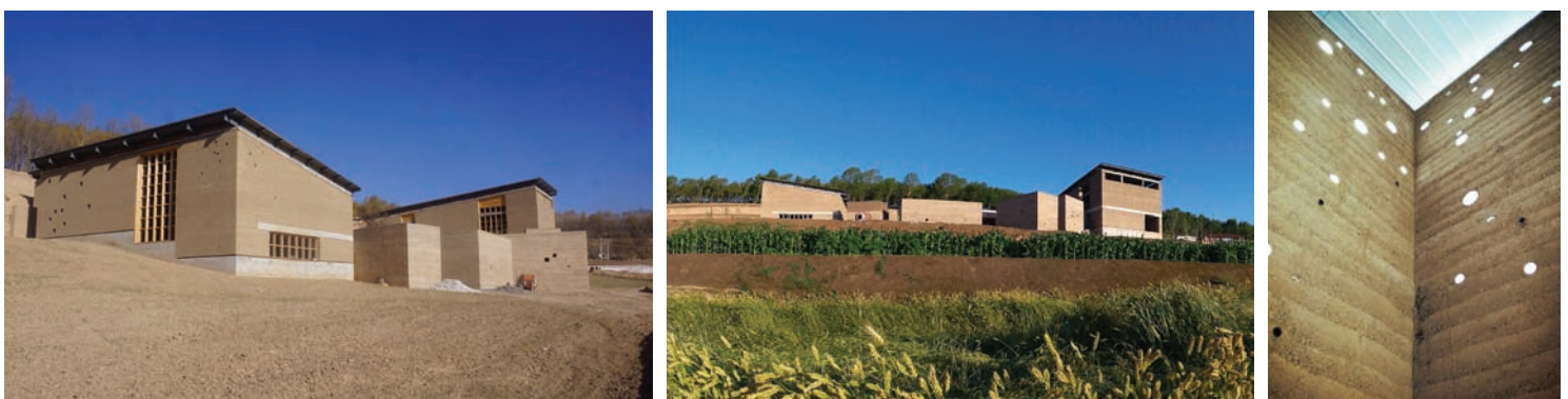
Fig. 9 Macha village center in Macha village, Gansu

Mu Jun, Z. T., Wang Shuai, Wang Mengyi (2014). Construction Manual of Rammed-earth Eco-dwelling . Beijing, China Architecture & Building Press.