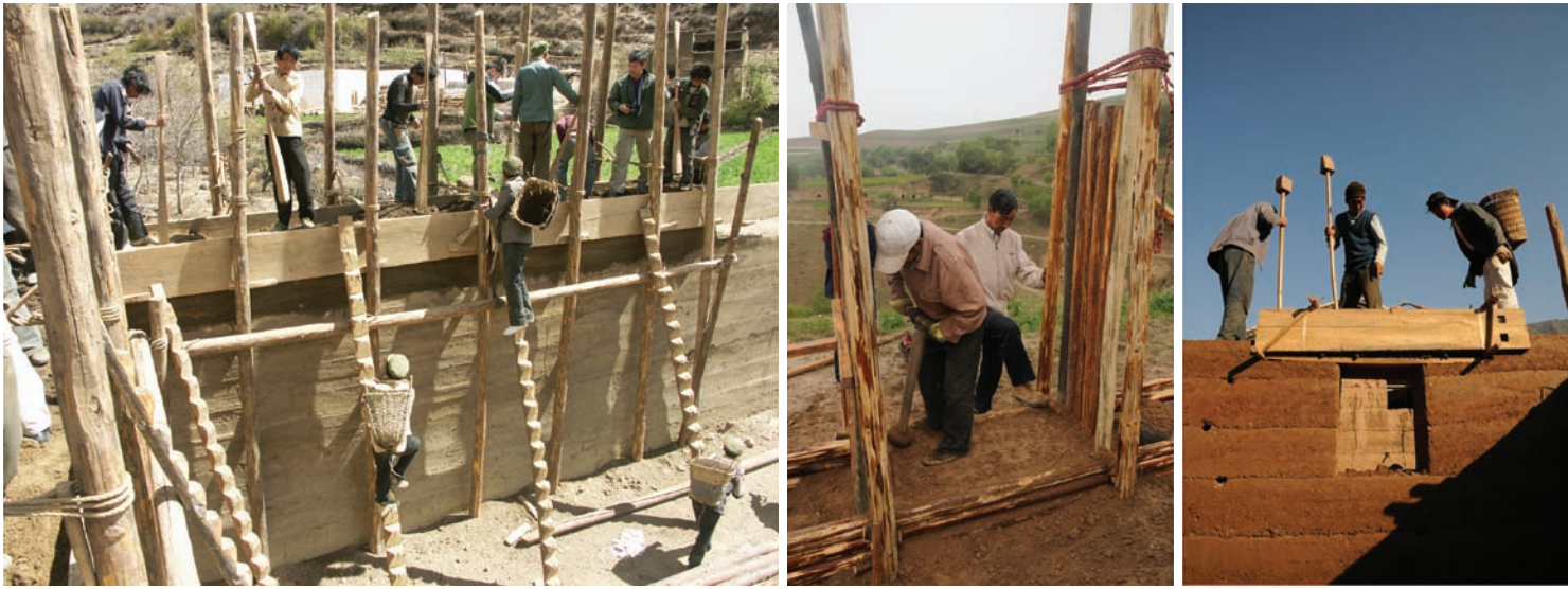
Fig. 2 Traditional shuttering systems of rammed-earth in China

periments with various samples of soil around the region. By providing a ramming force of over 0.5 MPa with the pneumatic hammer, the compressive strength of upgraded rammed-earth mass (40×40×150cm) reaches 1.4 MPa in average, almost twice the local traditional rammed-earth mass (Ying, 2012), even close to the one of China's conventional fired-brick walls.