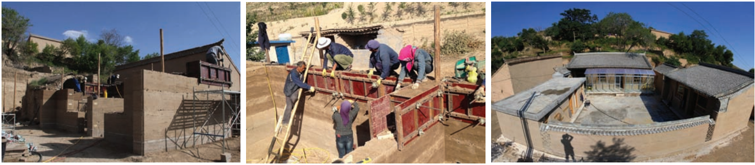
Fig. 6 The first rammed-earth prototype built in Macha village