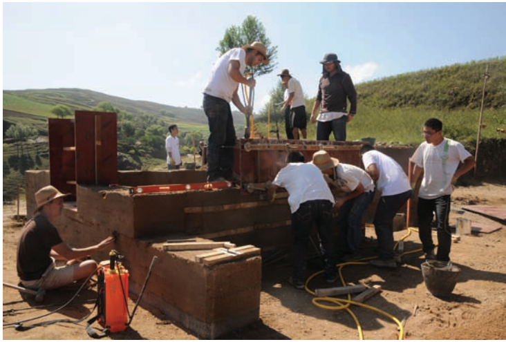
Fig. 4 On-site experimental construction