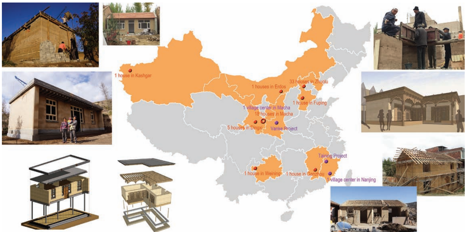
Fig. 7 Distribution of demonstrative constructions and regional impacts

According to observation and to statistics on the houses built in various provinces, the construction cost of new rammed-earth dwellings represents on average 2/3 of the cost of local conventional houses built with fired-bricks and concrete. When built with the assistance of neighbors, construction costs can get as low as 1/4 of the cost of conventional structures. Moreover, the embodied energy and CO 2 emission of the former amount to only 25% and 20% of the latter respectively. The ecological and economical potential of upgraded rammed-earth technologies is clearly illustrated through all cross-regional demonstration constructions. Informed and convinced, a growing number of governments and clients are actively asking for technical support. The cross-regional extension work has also drawn a lot of attention from China's mainstream media.