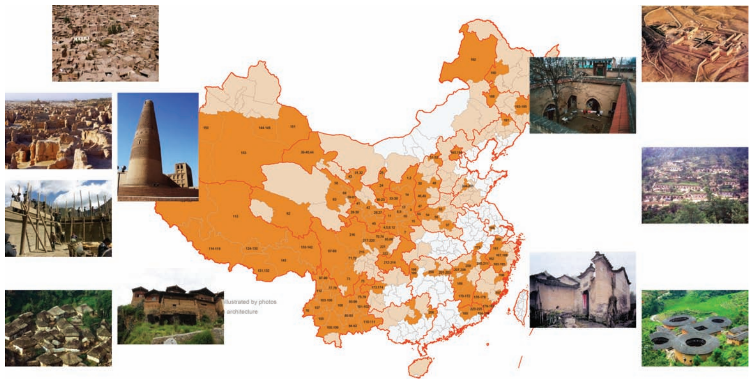
Fig. 1 China's traditional earth architectures and distribution

However, after several catastrophic earthquakes since 2008, a large number of earthen houses were severely damaged, which resulted in disappointment from villagers and local governments due to the lack of resistance seen in traditional earth-based buildings. Building with concrete and fired-bricks is always regarded as the only reliable option, perceived as both “safe” and “modern”. Consequently, the central government of China, in the past decade, has worked towards providing poor rural regions with financial and political support to replace millions of “dangerous” earthen dwellings with conventional concrete and fired-brick constructions. However, the actual result is that most of these replacement buildings have become dangerous and energy-inefficient, since the only affordable and viable way to build for most villagers is to simply “combine” concrete-based techniques with traditional building principles.