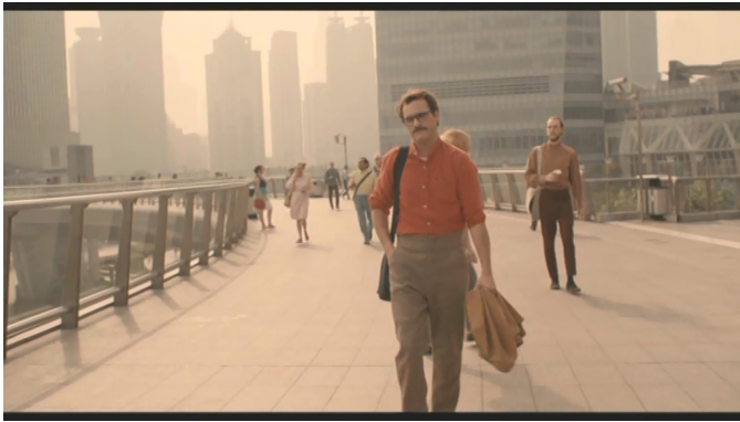
Figure 3. A specific, hybrid urban space [59:20]

Theodore goes on a trip to an unspecified, snowy landscape, together of course with Samantha, and enjoys long walks by himself, without his digital devices — i.e. without taking Samantha with him. These are the only sequences in which Theodore experiences space non-socially, alone, without the interaction of colleagues and friends who represent in a large part the strain he feels to get into a relationship, albeit virtual. This is a confirmation that the digital romance prevents his connecting with reality, but these sequences also testify to a more conventional treatment of Theodore's loneliness from a cinematic viewpoint, especially due to the music and camera movements which are fairly in the range of the expected. They show the incompatibility between the usual cinematic representation and the digital romance set in an environment that eludes realistic references.