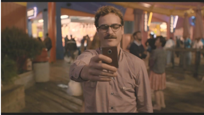
Figure 1. Theodore's relation to Samantha as a metaphor of film directing [23:37]

And during the only sex scene between them, looking like some kind of “phone sex”, the screen slowly becomes pitch dark, as if to suggest that this “digital” love scene eludes the capacity of the camera to represent frolics with a bodiless entity. All these elements both integrate the digital into the discourse on film and point to the difference the digital brings into our idea of filmic representation—actually, the sex scene in the dark is tantamount to confessing cinema is unable to capture their relation. The most significant scene in this regard is the very beginning of the film, which stages Theodore dictating to his computer without our seeing the machine first. He really seems to be talking of love to someone off screen—this is a transcript of his whole discourse: