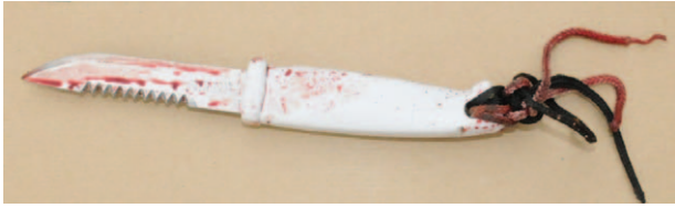
Figure 1. Knife found in the immediate vicinity of the body.

inflicted by a cutting instrument, with wounds being linked. Two of the neck wounds were particularly lacerated (Fig. 2); one of them was fatal via sectioning of the right internal carotid artery and right common facial vein. Exploration of the neck also showed, in addition to muscle wounds, wounds to the oropharynx and incomplete section of the right transverse process of the first cervical vertebra.