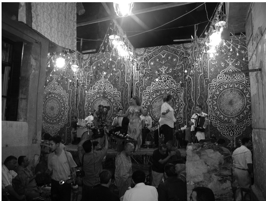
Photo 5.2 A stage at a street wedding in the Cairo neighborhood of Darb al-Ahmar, 2003

Still, one of the most salient features of Ahmad Wahdan's itinerary, amid this unending articulation of place and displacement, is the central question of