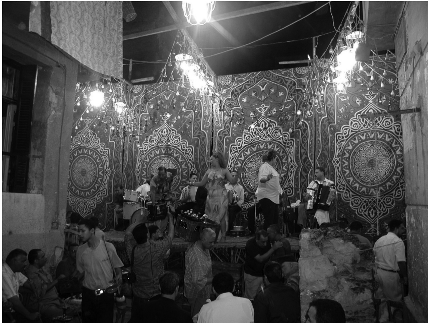
Photo 5.2 A stage at a street wedding in the Cairo neighborhood of Darb al-Ahmar, 2003

Still, one of the most salient features of Ahmad Wahdan's itinerary, amid this unending articulation of place and displacement, is the central question of