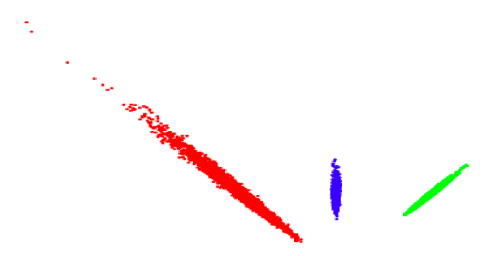
FIGURE 1 - 2 \times 2 dimensional mixture Gaussian Riemannian distribution projected on the Poincaré half-plane

where d^2(\cdot,\cdot) denotes the Riemannian distance in M. The associated function \psi(\eta_k) and \beta(\eta_k) are precised in [10] and [12]. For dimension 2, the sample set \mathcal{X} can be projected on the Poincaré half-plane using linear fractional transformations.