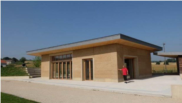
Figure 4. Maison pour Tous in Four, France © CRAterre_Moriset 2019.

This project has strengthened linkages between the concerned actors and has allowed to set operational methodologies and an acceptable legal framework. The success of this project has led to the launching of another pilot project using wattle and daub in 2019 in La Verpillière. Another project is foreseen in 2020, in the city of Bourgoin-Jallieu. Based on the two former experiences, it proposes numerous technical innovations aiming more efficiency of the building process and further improved accessibility through a potentially high reduction of construction costs for the construction of a 300m 2 building housing a school kitchen and refectory.