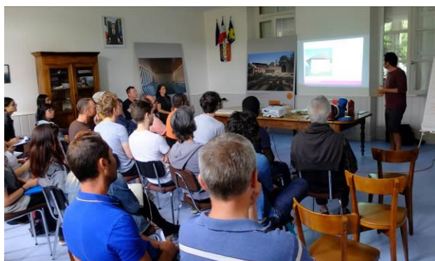
Figure 5. Training on rammed building's diagnostic, France.

The revival of rammed earth is strongly linked to governmental engagement but also to a vivid construction sector. There are still not enough professionals specialized in rammed earth to maintain the local heritage in good condition and to respond to the demand for new constructions (Figure 5). In recent years, vocational training institutions such as AFPA (National association for professional training of adults) are proposing training modules on rammed earth for the teaching of good practices to young masons (Guillaud, 2014). However, this dynamic needs to be strengthened by fostering collaboration between training institutions and ensuring quality trainings based on important results such as the referential of competences in earthen construction (ECVET Acquis-terre). A better dissemination of the results of recent researches within both the professional sector and training institutions is also needed. The book on rammed earth rehabilitation (Moriset, Joffroy, 2018) which has been published recently, gives detailed informations on rehabilitation techniques and will contribute to the improvement of the quality of the interventions in the public and private spheres.