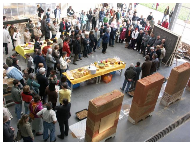
Figure 2. Inauguration of the Grains d'Isère Festival with the presence of local politicians © CRAterre 2012.

The yearly Festival Grains d'Isère in Villefontaine at the Grands Ateliers de l'Isle d'Abeau , financed by local governments and organized by the CRAterre-ENSAG research laboratory since almost twenty years. This festival, whose aim is to enhance and develop knowledge related to construction with earthen material, includes demonstrations, conferences, visits and workshops for various audiences (professionals, politicians, school kids' groups, house owners, etc.) (Figure 2).