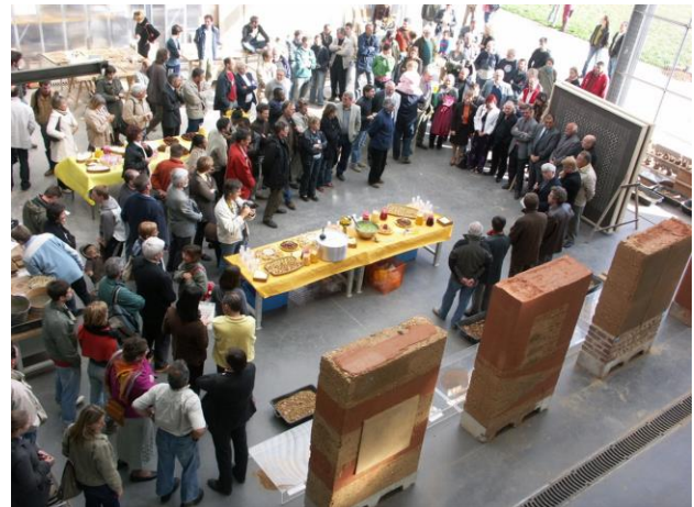
Figure 2. Inauguration of the Grains d'Isère Festival with the presence of local politicians © CRAterre 2012.

The yearly Festival Grains d'Isère in Villefontaine at the Grands Ateliers de l'Isle d'Abeau , financed by local governments and organized by the CRAterre-ENSAG research laboratory since almost twenty years. This festival, whose aim is to enhance and develop knowledge related to construction with earthen material, includes demonstrations, conferences, visits and workshops for various audiences (professionals, politicians, school kids' groups, house owners, etc.) (Figure 2).