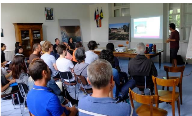
Figure 5. Training on rammed building's diagnostic, France © CRAterre_Moriset 2019.

The revival of rammed earth is strongly linked to governmental engagement but also to a vivid construction sector. There are still not enough professionals specialized in rammed earth to maintain the local heritage in good condition and to respond to the demand for new constructions (Figure 5). In recent years, vocational training institutions such as AFPA (National association for professional training of adults) are proposing training modules on rammed earth for the teaching of good practices to young masons (Guillaud, 2014). However, this dynamic needs to be strengthened by fostering collaboration between training institutions and ensuring quality trainings based on important results such as the referential of competences in earthen construction (ECVET Acquis-terre). A better dissemination of the results of recent researches within both the professional sector and training institutions is also needed. The book on rammed earth rehabilitation (Moriset, Joffroy, 2018) which has been published recently, gives detailed informations on rehabilitation techniques and will contribute to the improvement of the quality of the interventions in the public and private spheres.