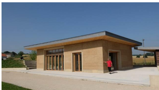
Figure 4. Maison pour Tous in Four, France © CRATERre_Moriset 2019.

This project has strengthened linkages between the concerned actors and has allowed to set operational methodologies and an acceptable legal framework. The success of this project has led to the launching of another pilot project using wattle and daub in 2019 in La Verpillière. Another project is foreseen in 2020, in the city of Bourgoin-Jallieu. Based on the two former experiences, it proposes numerous technical innovations aiming more efficiency of the building process and further improved accessibility through a potentially high reduction of construction costs for the construction of a 300m 2 building housing a school kitchen and refectory.