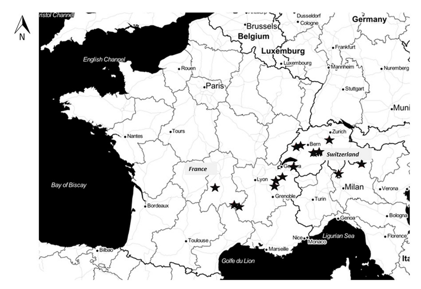
Fig. 1. Geographical location (stars) of the 14 studied lakes distributed in France and Switzerland.

spatial distributions adding uncertainty to hydroacoustic estimates. Furthermore, fish species diversity implies a high variability of behaviours and movements, according to biotic and abiotic factors (Matthews, 2012). Fish perform vertical and horizontal migrations depending on abiotic factors, such as temperature, luminosity (day, night, and lunar cycle), and turbidity, and on biotic factors such as life stage (adults, juveniles, and larvae), species interactions (e.g., prey-predator and competition), and resources (Bohl, 1979; Mehner, 2012; Sajdlová et al., 2018). Therefore, the choice of the sampling period (e.g., season and time of day) is important as it can greatly affect hydroacoustic results.