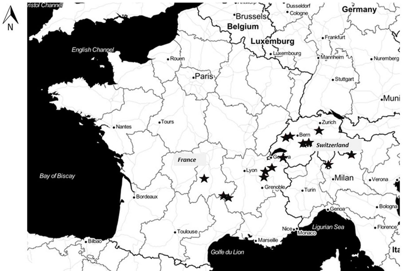
Fig. 1. Geographical location (stars) of the 14 studied lakes distributed in France and Switzerland.

spatial distributions adding uncertainty to hydroacoustic estimates. Furthermore, fish species diversity implies a high variability of behaviours and movements, according to biotic and abiotic factors (Matthews, 2012). Fish perform vertical and horizontal migrations depending on abiotic factors, such as temperature, luminosity (day, night, and lunar cycle), and turbidity, and on biotic factors such as life stage (adults, juveniles, and larvae), species interactions (e.g., prey-predator and competition), and resources (Bohl, 1979; Mehner, 2012; Sajdlová et al., 2018). Therefore, the choice of the sampling period (e.g., season and time of day) is important as it can greatly affect hydroacoustic results.