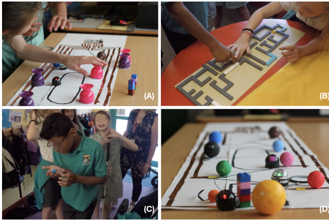
Figure 3. The developed game: (A) the Planet Board where Ozobots travel from one planet to another; (B) a Lego Navigation Map to locate kidnapped planets; (C) which must be retrieved from somewhere in the school; (D) completed board with all planets saved.

evaluation (Romeo could not attend). They were split into two groups (four/three children and two/one TAs in each group) and played the game from start to finish, lasting between 30 and 40 minutes. One TA played the role of a planet kidnapper, instructed on where to go to hide kidnapped planets. One researcher played the role of the game narrator, guiding the children through play. Another researcher observed play, took notes and kept time.