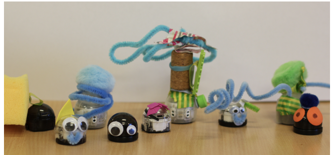
Figure 1. Customising Ozobots with anthropomorphic features and clothing items to allow for tactile identification and tracking.

DOI: https://doi.org/10.1145/3313831.3376270