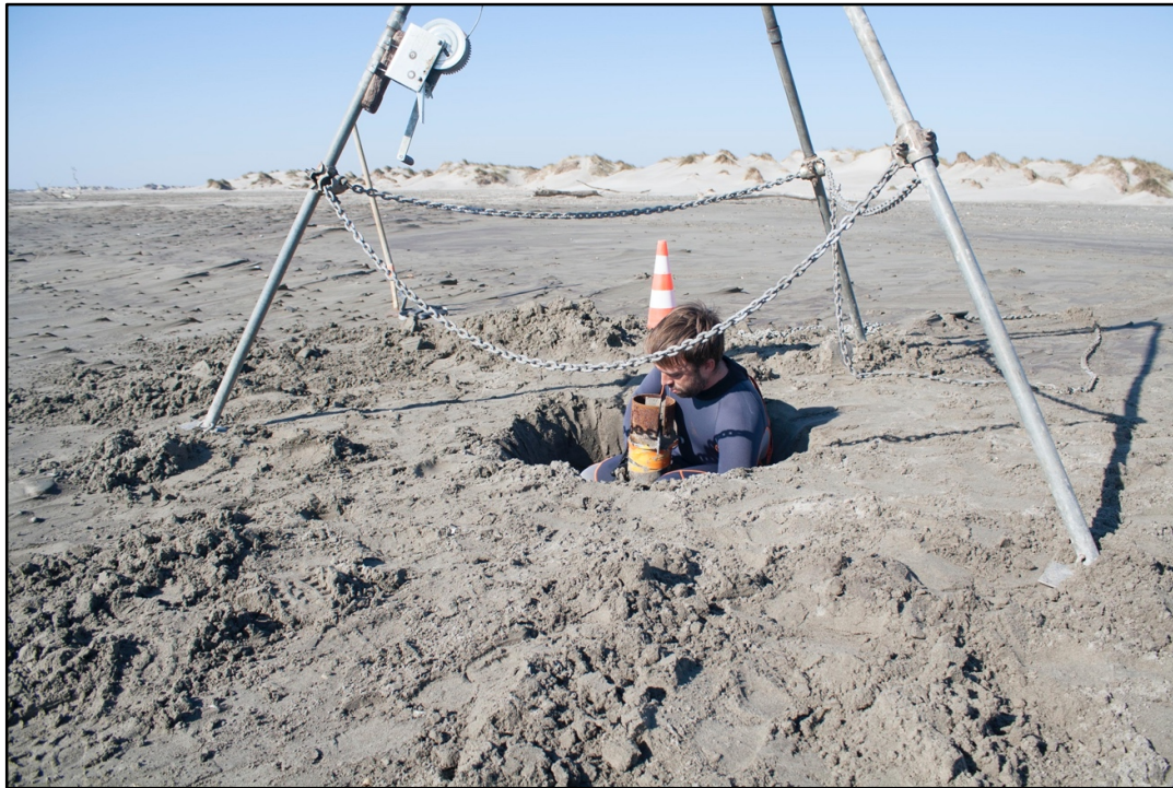
Figure 2. The day after the ‘ What on Earth ’ event. Thanks to the efforts deployed the day before, the tube has been lifted up to the sand surface, i.e. nearly 1.5 m above its initial position. The game was almost won.

Damien still tells this story from time to time, particularly when he sees students and colleagues a bit too confident when using motorpumps.