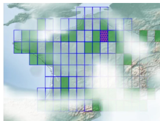
Fig. 1. France completion in progress.

Among the various types of imagery requests, we focus on large area coverage requests as represented on Figure 1. Each request consists in a set of meshes covering the area to acquire. It requires months or even a year to acquire them all. Moreover, uncertainties have a huge impact on the validation of the image acquired. On such long time-frames, weather uncertainty is even more crucial since there are no accurate weather forecasts. The selection of acquisitions according to the weather forecasts directly impacts the overall time-to-completion of the request.