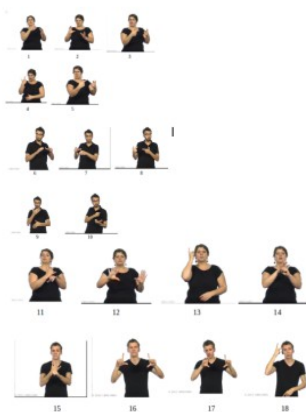
Figure 1: Sign Language example screenshots

Relevant screenshots of the LSF translation are given in fig.1, in chronological order of the utterance. Here is the global meaning of what is signed as translation: in Sao Paulo which is located around here in Brazil, criminals already assaulted police forces, and now official sources tell us that it happened again. They announce the number of victims, and the growing mutinies in prisons.