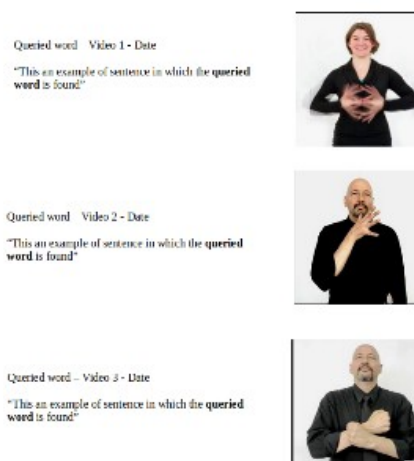
Figure 5: An example of display for the concordancer

The matching results are displayed as they would be in a text-to-text bilingual concordancer, except that it includes videos. It could be displayed like the following: