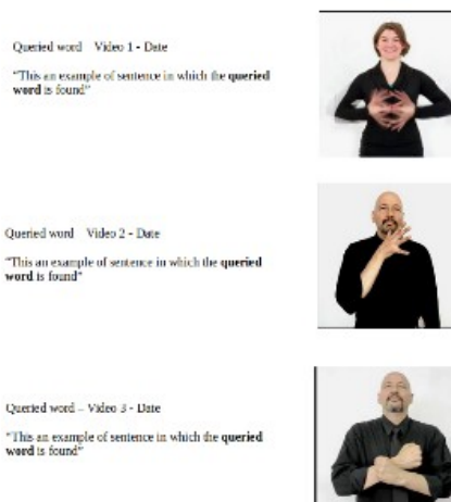
Figure 5: An example of display for the concordancer

The matching results are displayed as they would be in a text-to-text bilingual concordancer, except that it includes videos. It could be displayed like the following: