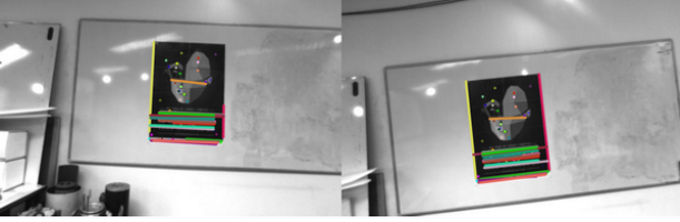
Fig. 3. Successful line matching between the image frame 169 (right) and the reference frame (left). Colorful points in both images are point correspondences used for our line matching algorithm.

• Line-feature detection and matching: Line-features are extracted using the probabilistic Hough transform (Matas, Galambos & Kittler 2000) with the OpenCV’s HoughLinesP routine. Each extracted line in image coordinates (given by two points p_1^{\text{im}} and p_2^{\text{im}} in homogeneous coordinates) is then transformed into the line representation used in this paper (i.e., the normal to the plane containing the scene’s line and the camera focal point) as