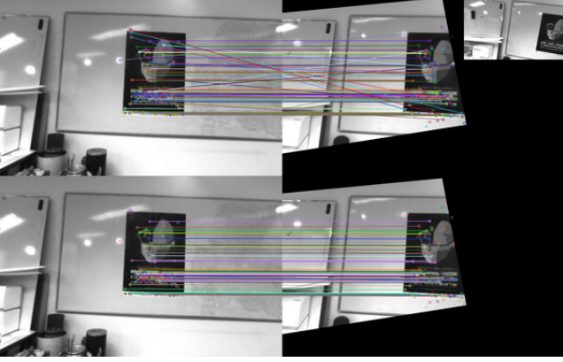
Fig. 2. Matching point correspondences between the warped image frame 264 (warped by the predicted homography) and the reference frame. Poor matching (top) and excellent matching (bottom) before and after applying our outlier removal procedure. Reference frame (left), warped current frame (right), current frame (small image on top right corner).